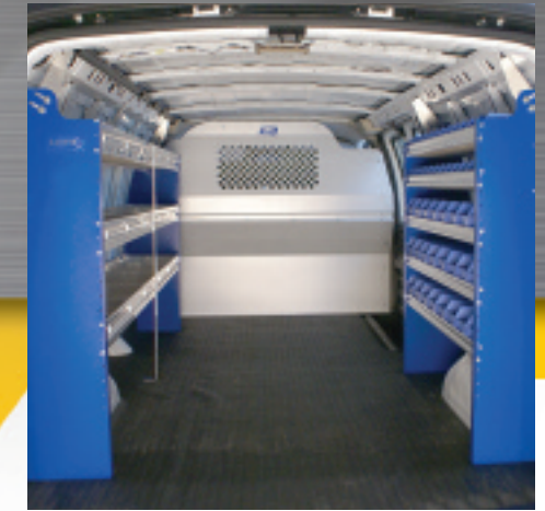
Model 30G, 408 and 524 shown